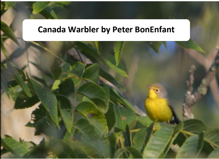
Canada Warbler

Shagbark Nature Park is owned by The Town of Fort Erie and is located west of Burleigh Road, north of Dominion Road and south of Nigh Road in Ridgeway. Bert Miller Nature Club is the steward of the park under agreement with the Town. Access is via a parking lot on Burleigh Road, just north of Dominion Road. If you go, take all precautions against ticks, including (most importantly) staying on the mowed paths.